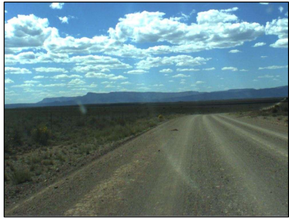
Photo 8: Available SSD to the north along the R306 form OP8845 (>300m)