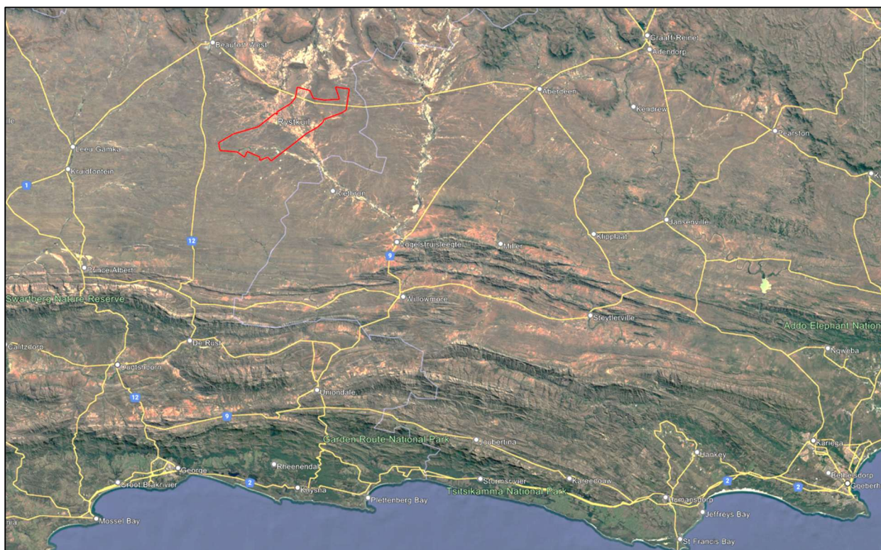
Figure 1: Locality Map.

The mining operation and processing plant (CPP) will be located near the main ore body on the farm Rystkuil, approximately 50km to the southwest of Beaufort West. Refer to Figure 1 below for a locality map.