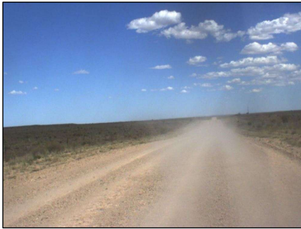
Photo 7: Available SSD to the south along the R306 form OP8845 (>300m)