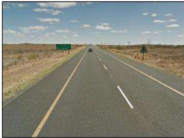
Photo1: Westbound view along the N1 towards N12